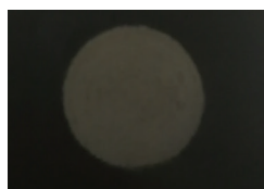
Beam profile of the amplified pulse

1. All the data in the above table are the typical values obtained from the tests at room temperature of 25°C, and the final data is subject to the final test report.